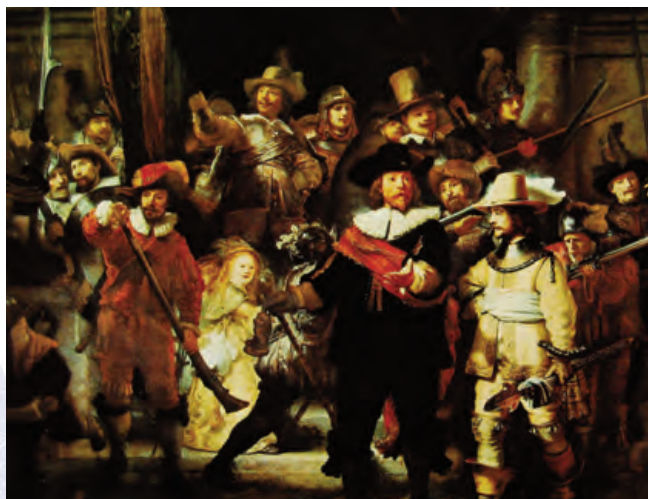
The Night Watch, Rembrandt van Rijn

Minimum number of participants: 25 persons