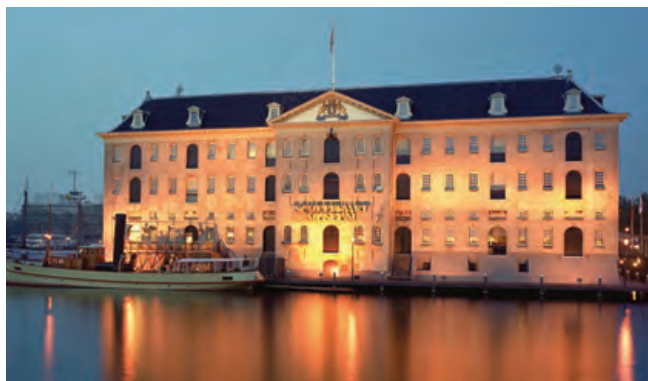
National Maritime Museum